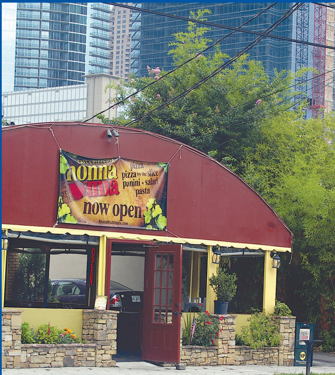
Nonna Mia Now Open